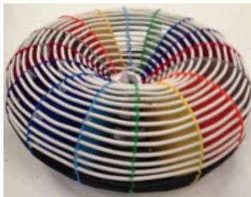
Introducing Plasmoid Technology

The competitive advantage is that the Thunderstorm Generator is a minimal cost “add on” that reduces fuel costs rather than an expensive alternative and at the same time reduces/eliminates carbon (CO 2 /CO) and other pollutants.